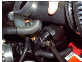
Fig. # 15