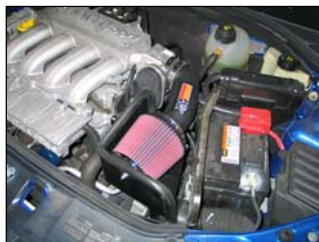
Fig. # 18