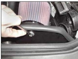
Fig. # 17