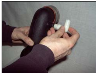
Fig. # 14