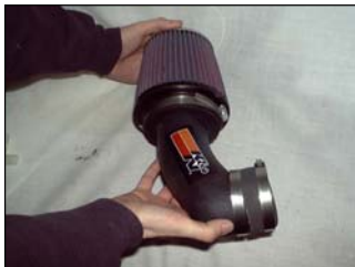
Fig. # 13