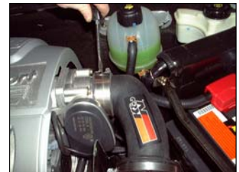
Fig. # 16