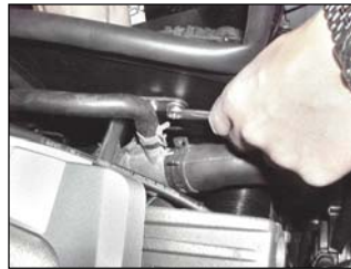
Fig. # 11