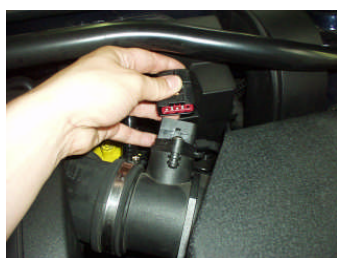
Fig. # 1

WARNING: Before starting the engine carry out a final fitment check of the K&N performance kit. It will be necessary for all intake systems to be checked periodically for realignment, clearance and tightening of all connections. Failure to follow the above instructions or proper maintenance may void the warranty.