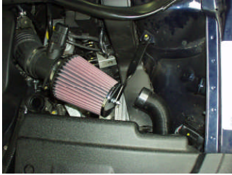
Fig. # 13