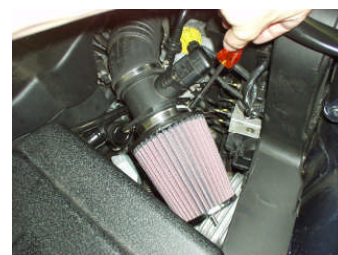
Fig. # 8