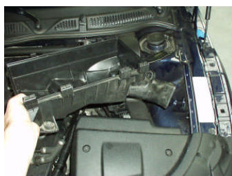
Fig. # 5