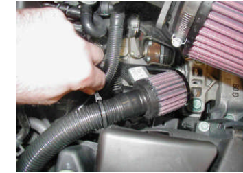
Fig. # 16