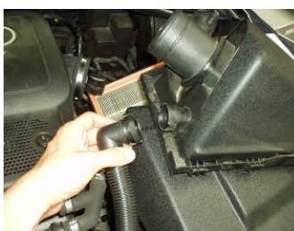
Fig. # 3