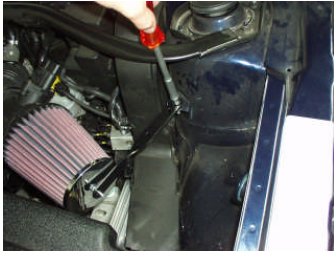
Fig. # 9