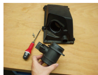
Fig. # 4