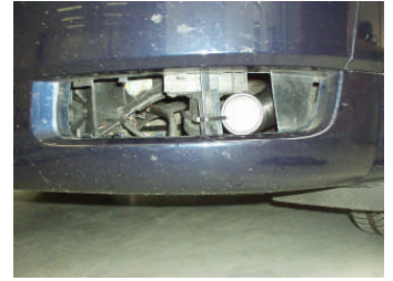
Fig. # 12