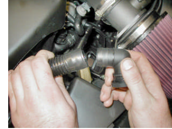
Fig. # 14