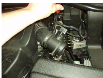
Fig. # 6