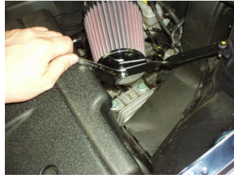
Fig. # 10