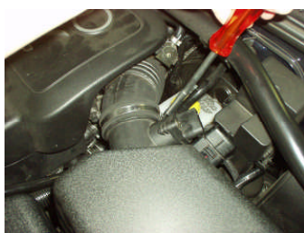
Fig. # 2