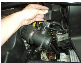
Fig. # 7