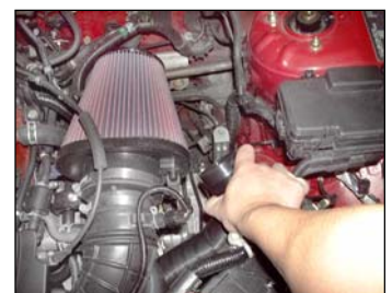
Fig. # 12